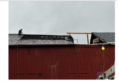
In January, removal of the south side began.