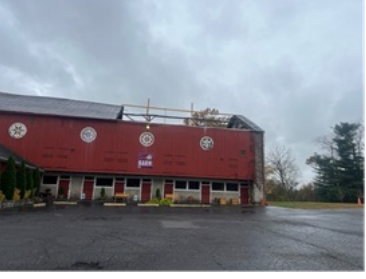
The north half of the roof was removed first.