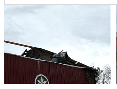
The work began in September 2022 with the removal of the existing leaking roof and badly damaged purlins.

We are saving this amazing 175 year old piece of history!