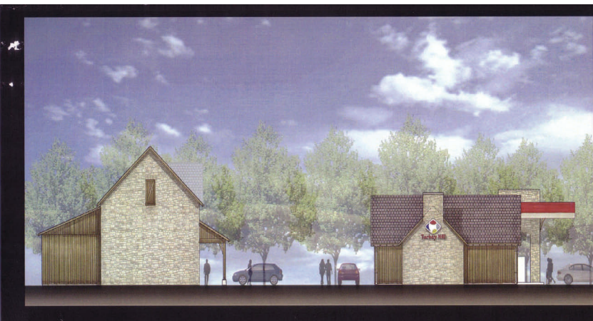
Proposed Turkey Hill gas station, convenience store, and car wash

The Meeker farmhouse, the first portion of which was built in 1812, is a Federal style, two-story, brick, center-hall residence known as an I-House form. It is in a remarkably original state of preservation, and shows the results of many generations of careful stewardship. The chestnut floors, cherry interior woodwork, built-in cabinetry and center stairway are marvelously original, and help foster the impression that you have just