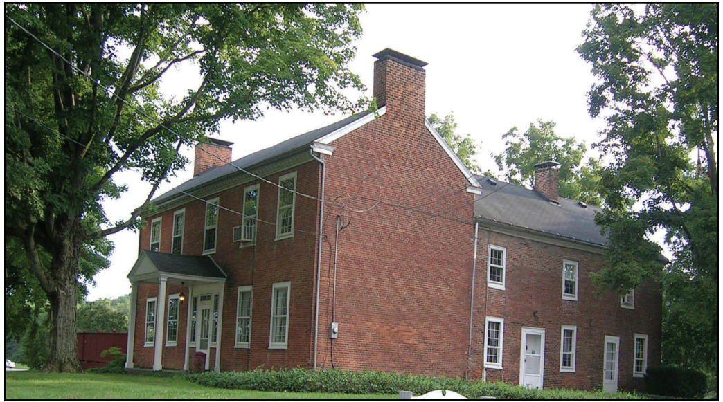
Meeker House, the current location of Garth's Auctions