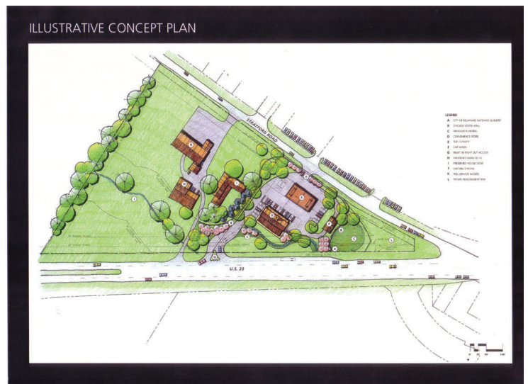
Concept Plan will be on display at Annual Meeting

The large, two story stone end barn was built ca. 1820. The massive stone walls are laid of squared and coursed rubble limestone, and the long sidewalls are vertical board siding. There are two single story frame additions to the main barn, and the interior has been updated over the years with all of the modern amenities required to operate the finest antique auction house in the Midwest, including modern heating, rest rooms and kitchen. There is also a recently built storage barn and garage on the site.