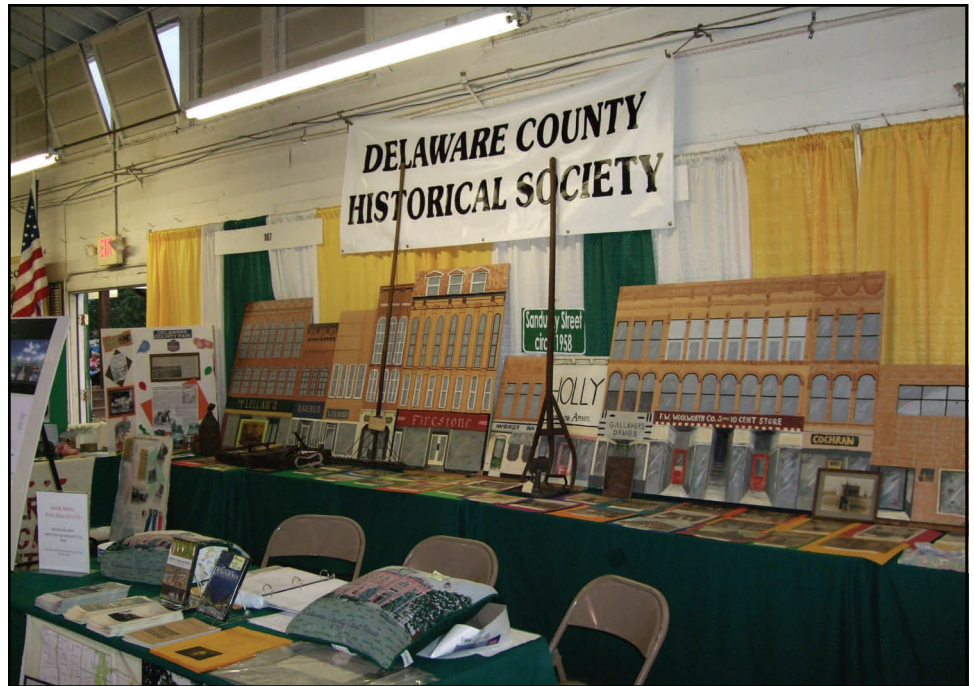
Historical Society Booth at the 2009 Delaware County Fair

The Meeker property display boards drew the attention of hundreds of fairgoers. Thanks to all the efforts of our volunteers who described the possibilities of the Meeker property, the