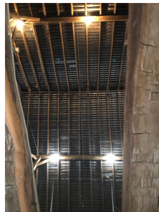
Clear view of the roof