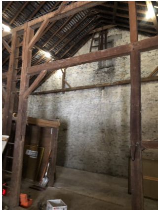
South end of barn cleared out