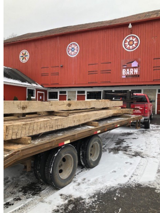
New beams delivered