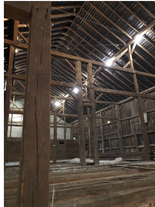
Modern interior structure removed