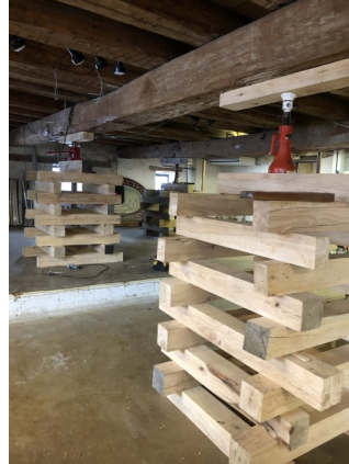
Temporary supports installed