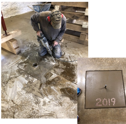
Preparing for new footers