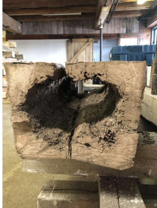
Rotted beams removed