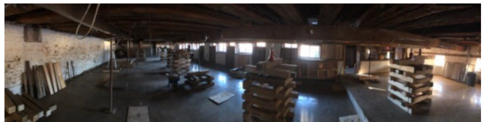
An overview of the lower barn